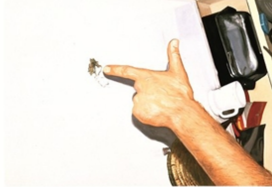
A PAINTING BY ANITA STORCK