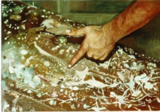
A PAINTING BY ELMIRE BOURKE