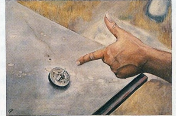
A PAINTING BY PAT PERDUE