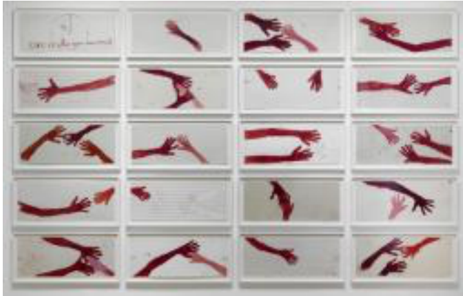
Louise Bourgeois, 10 am when you Come to me , 2006